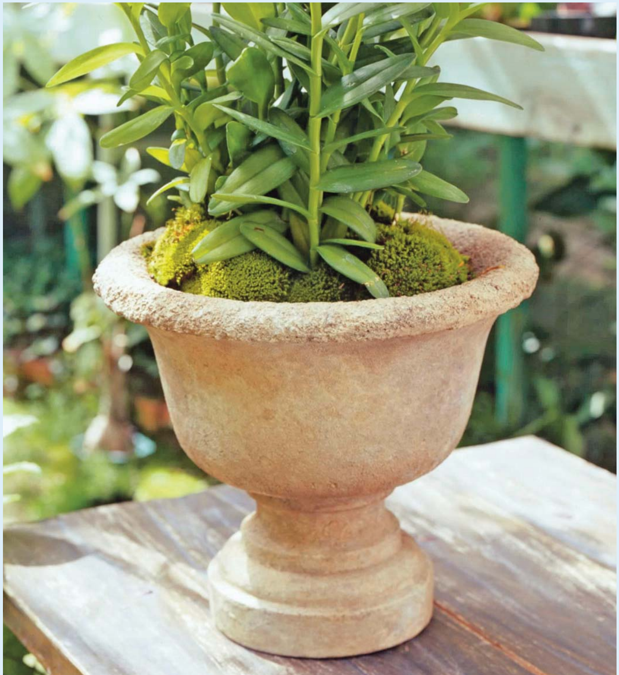
SMALL URN MLT 44