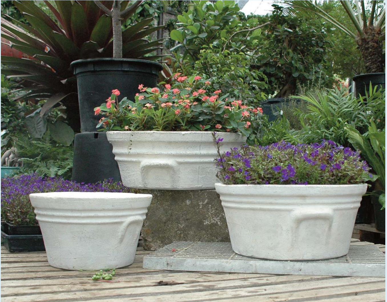
LOW PROFILE WATTS POTS MLT 25 - LOW