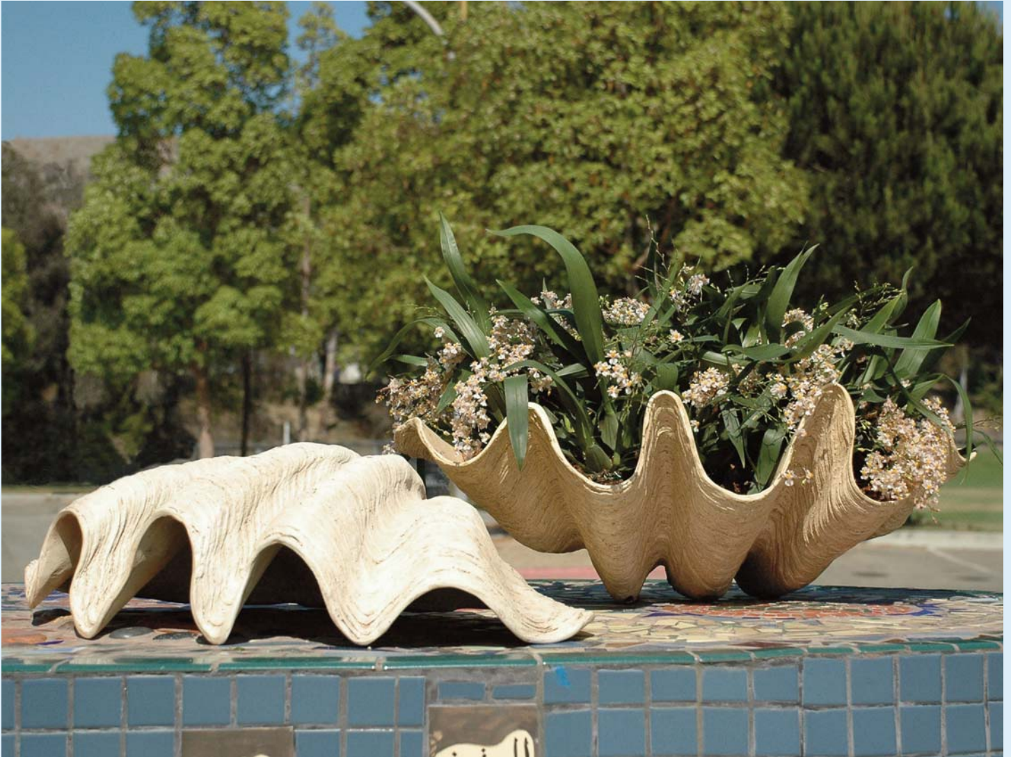
CLAM SHELLS MLT 17 / 18