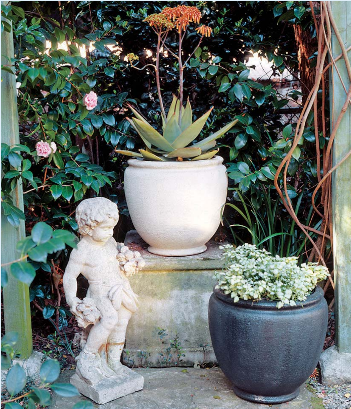
ROUND URN PLANTER MLT 16